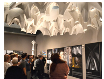
TOP: Central and lateral nave of the Sagrada Família, seen from the transept. ABOVE: Exhibit opening on 29 September.