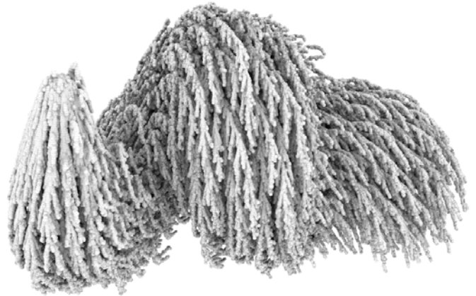
Rendered image of a point cloud created using toxiclibs/simutls with the DLA process applied to a spiral curve

The measure of the project will not be the worth of the proposed pedagogy, but rather the quality and legibility of the architecture as registered against the pedagogical proposition. In this way, students are encouraged to be radical and experimental in their interpretation of the program