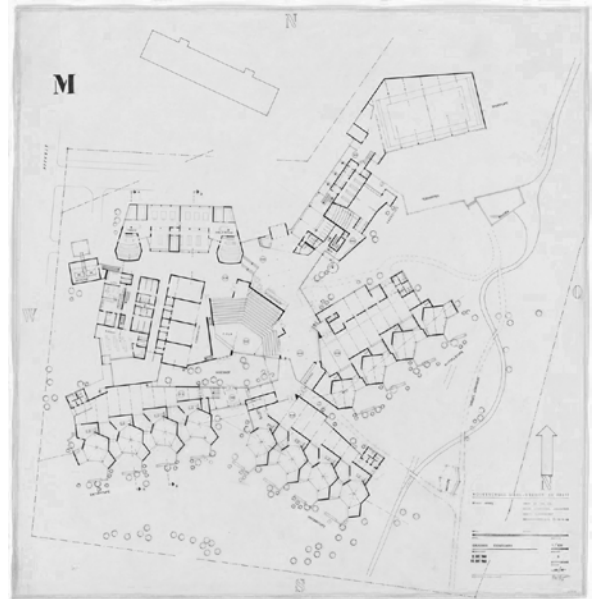
Hans Scharoun, Haupt und Grundschule, Marj

Models, drawings and images are the communication methods for all of the assignments this semester. They will be used to frame questions and propose answers. Group discussion and pinups, in addition to desk-crits, will make up a large part of studio time, and it is expected that in order to facilitate the productive exchange of ideas that projects will be documented on paper and through physical models. A significant percentage of students' work will take place in the computer, but studio discussions will often take place away from the screen. Process and communication are interrelated but separate activities, and students are expected to invest in developing a high level of fluency in both. In general, a significant emphasis will be placed on the quality, craft, and success of the documentation. Throughout the semester, projects will be assessed based on both the merits of their content and on the visual expression of that content