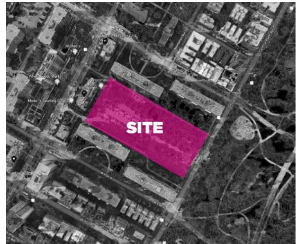
Site location @ 98 th Street & CPW - Manhattan

"Sorry to Bother You," Boots Riley, 2018