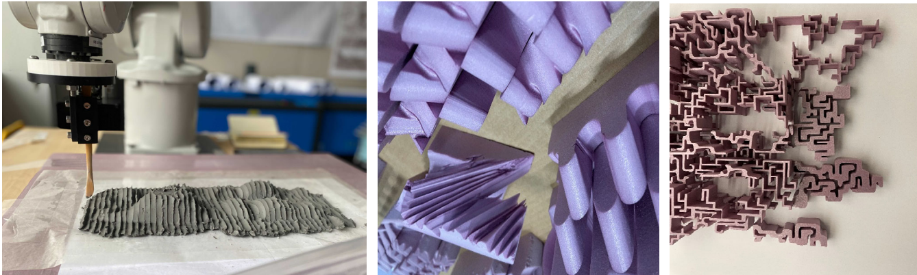
Clay/Site 'Scribing' – K. Hernandez'; Foam Cutting Forms – D. Parsan; Labyrinth Cutting – Isaac Corniel

We will also explore the application of robotics to materials and assembly, devising and developing means of mounting tools such as scrapers, small mills (such as a Dremel) and hot wire equipment to cut and form relatively soft and workable materials such as foam, clay and sand casts. In addition, we will use mounted gripping devices to assemble simple and light-weight geometric components into compositions and mount extruders to carry-out additive form-making.