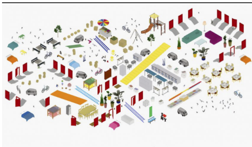
Ten architecture projects by students at City College of New York